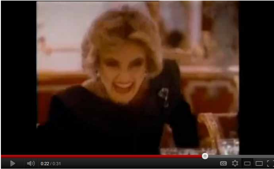
Figure 3: NYC Is Not For Sale Television Ad

In 2009, New York City’s real estate industry came together to plan an unprecedented independent expenditure campaign to counterbalance the success of candidates backed by the Working Families Party (WFP) and its allies in the labor movement.